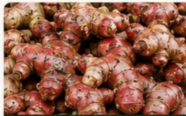
1. SELECTED RED GINGER