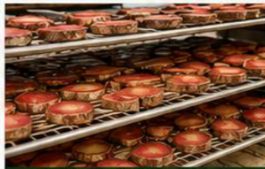
2. WASHING & DRYING