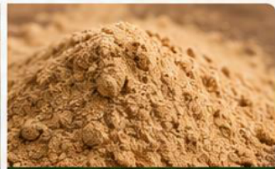
4. FINE POWDER